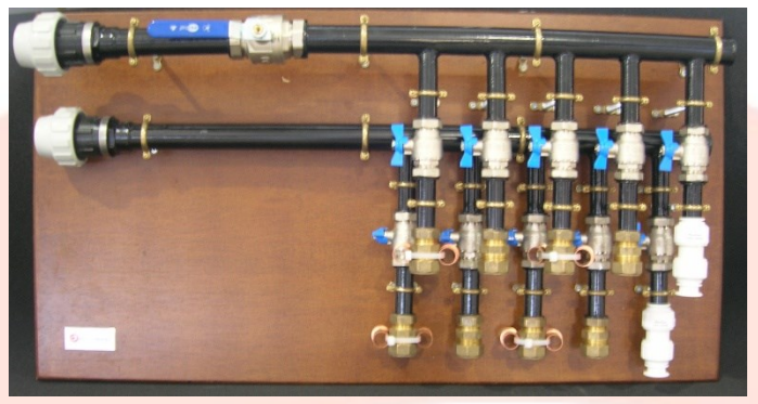
Fig 3- 4 way 'left' handed manifold