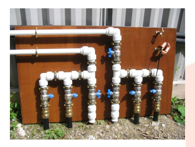
Fig 2- 2 way universal manifold (set for left handed)

Any ground pipes inside the building should be insulated using a vapour barrier insulation, such as "Armaflex" to prevent dripping from condensation. Any pipe outside the building need not be insulated since the circulating fluid contains anti-freeze.