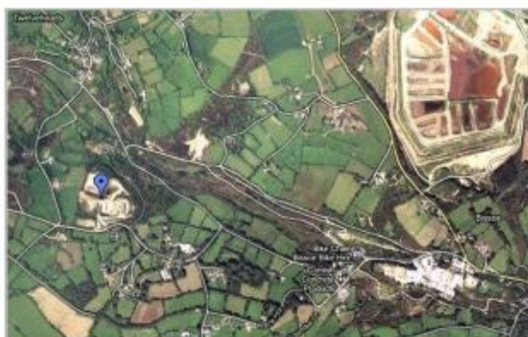
Satellite Image of Kensa Heat Pumps (blue pin)