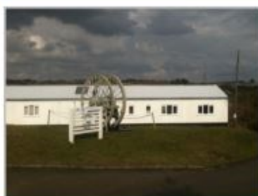
Site entrance to Kensa Engineering

For directions from Truro, the A30, & Falmouth, turn to the next page.